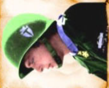
ARMY - WWII