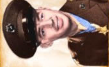
USMC - KOREA