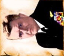
NAVY - VIETNAM