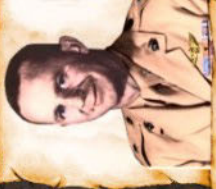
USMC - WWII