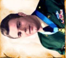
ARMY - VIETNAM