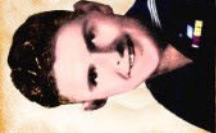
NAVY - WWII