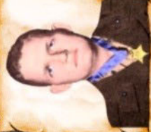
USMC - WWII