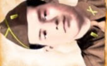
ARMY - WWII