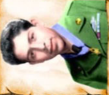
ARMY - KOREA