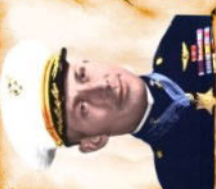
USMC - KOREA