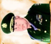
ARMY - WWII