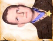
USMC - WWII