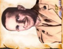
USMC - WWII