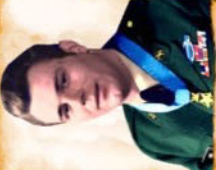
ARMY - VIETNAM