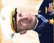
USMC - KOREA