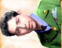
ARMY - KOREA