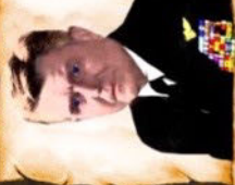
NAVY - VIETNAM