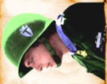
ARMY - WWII