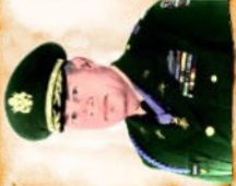
ARMY - WWII