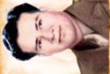
ARMY - WWII