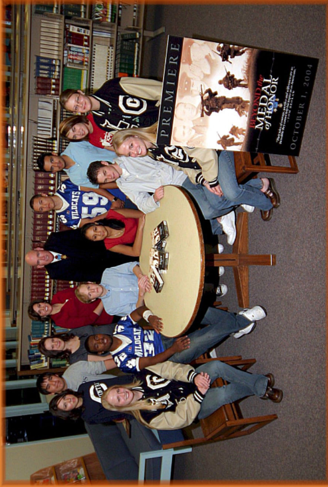
Medal of Honor recipient Peter Lemon (Vietnam) visited with students at Pueblo's Central High School to give them copies of the recently released documentary Beyond The Medal of Honor . The 4-hour documentary details the story of Pueblo, Colorado's four Medal recipients, two of whom (Bill Crawford & Carl Sitter) graduated from Central High School.