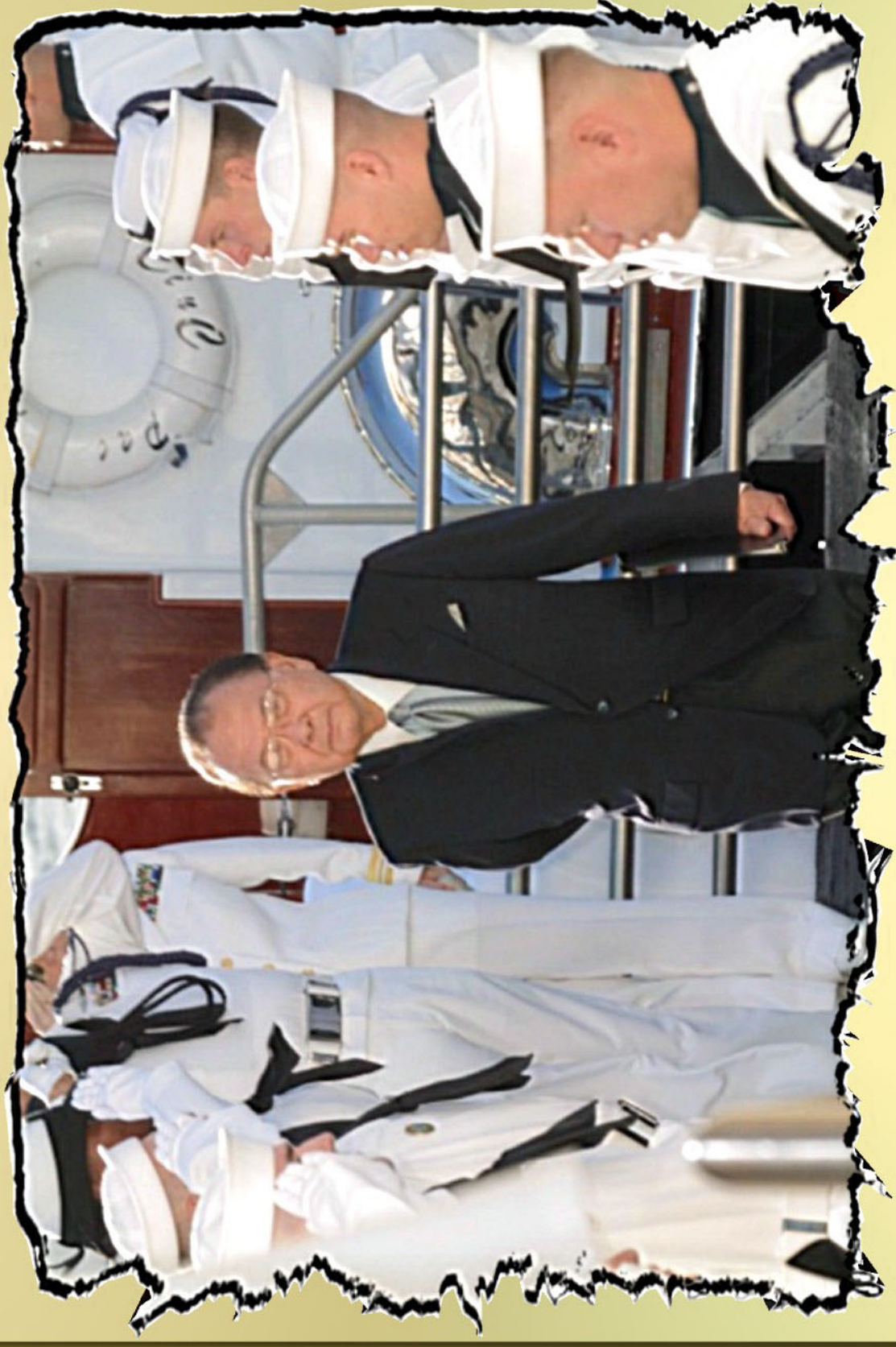
Senator Daniel Inouye of Hawaii, a member of World War Two's famed 442nd Go For Broke Regiment, is the Medal of Honor recipient currently serving in either house of the United States Congress.