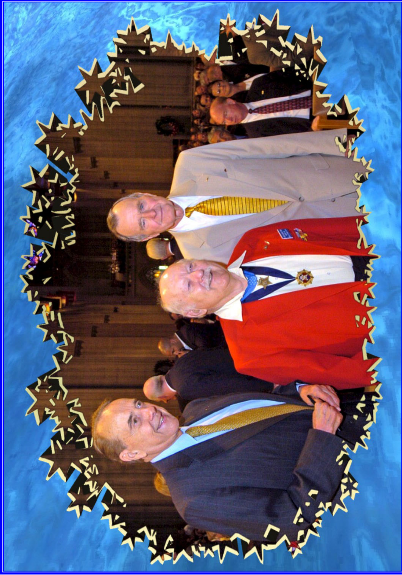
Medal of Honor Recipient Jack Lucas (USMC) joins fellow World War II veterans Senator Bob Dole and President George H.W. Bush in the ceremonies to dedicate the new memorial in Washington, D.C. to all 16 million men and women of The Greatest Generation who served to defend freedom in World War II.