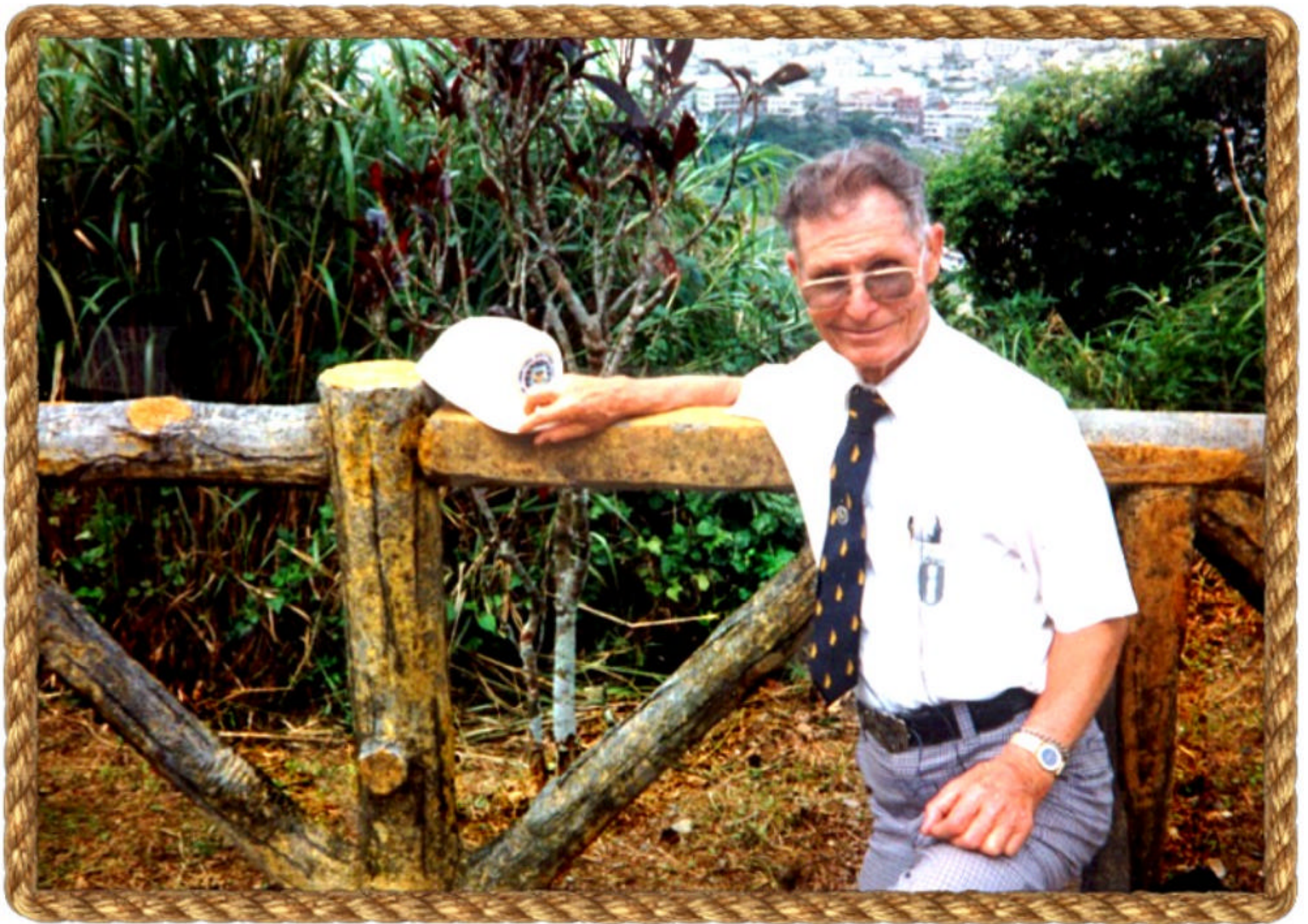
Fifty years after the battle for Okinawa, World War II medic Desmond Doss returns to the spot on the Maeda Escarpment where he rescued more than one hundred wounded soldiers and earned the Medal of Honor.