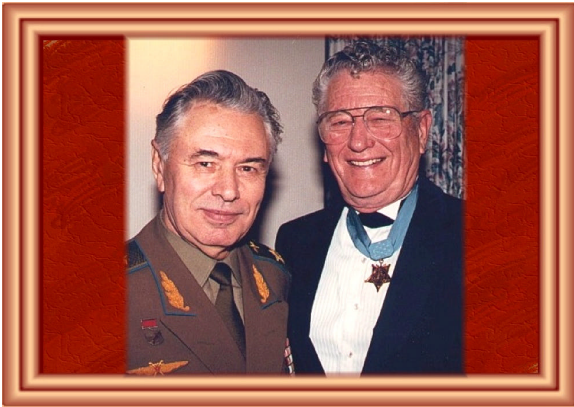
WWII Marine Corps Ace of Aces Joe Foss with a Russian soldier who received his own Nation's version of the Medal of Honor.