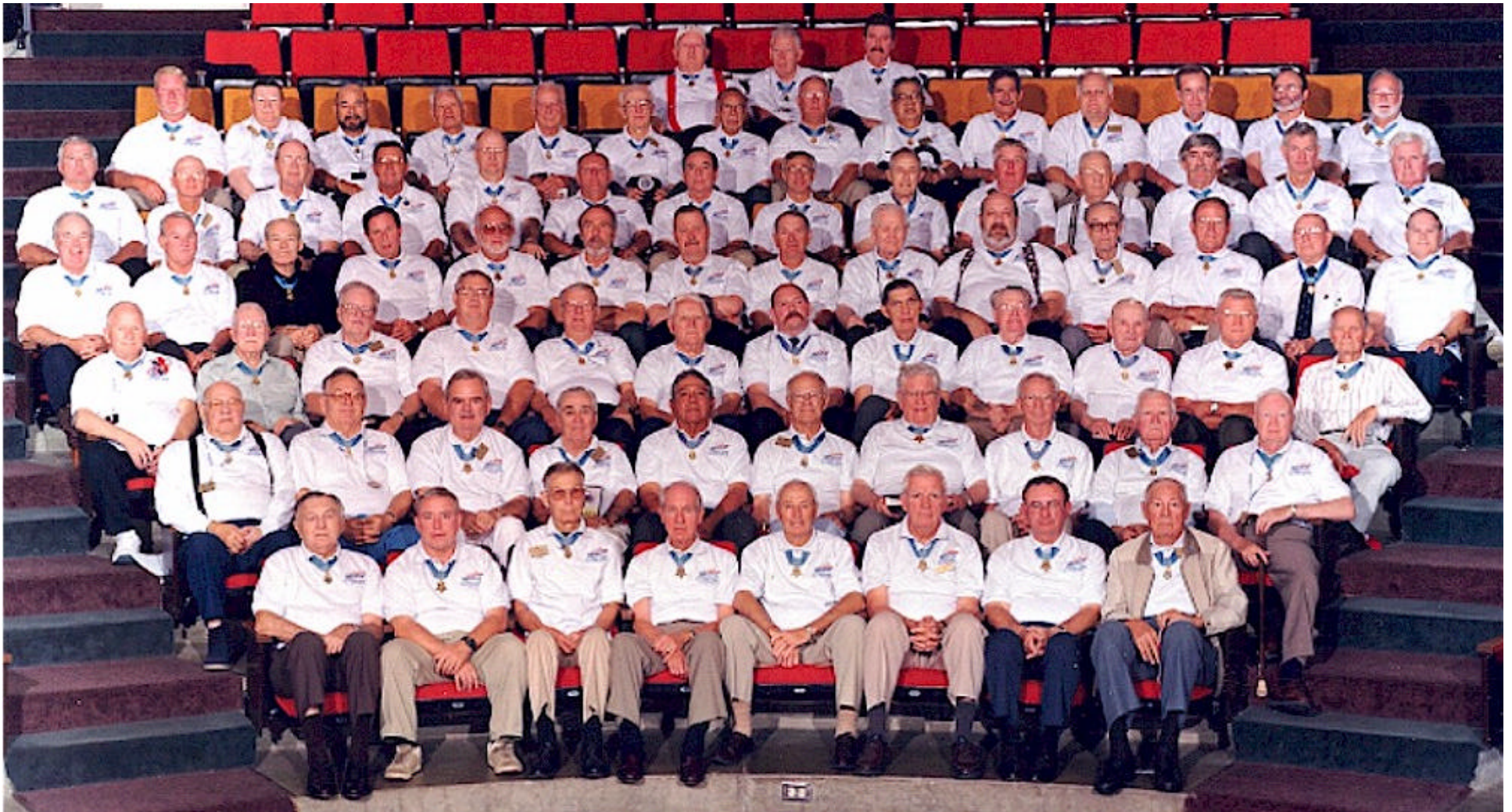
Seventy-five of the living Medal of Honor recipients pose for a group photo during Convention 2000 in Pueblo, Colorado