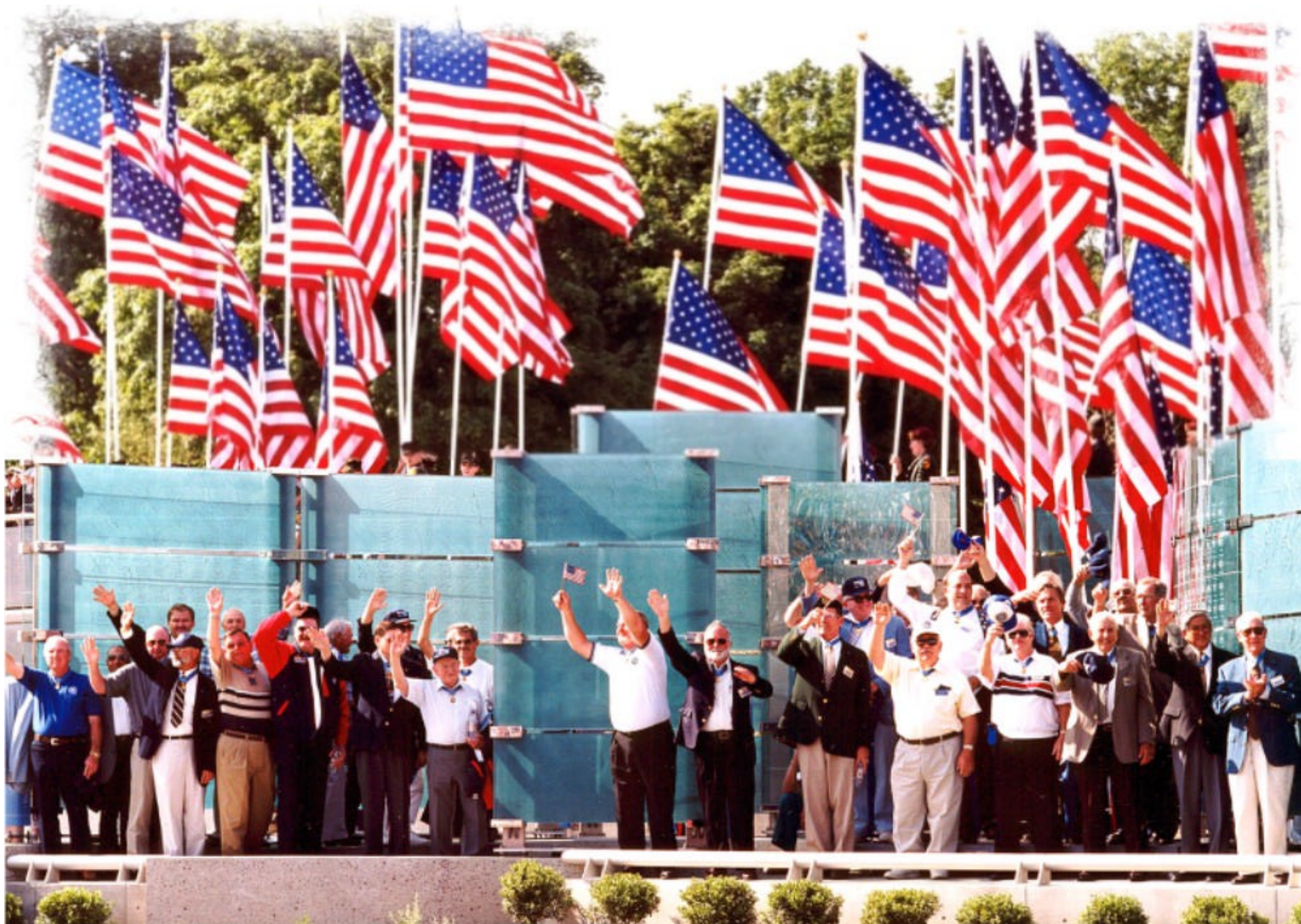
More than 100 of the living Medal of Honor recipients joined the citizens of Indianapolis for Memorial Day in 1999 in activities that included a patriotic parade and the dedication of a new National Memorial to all recipients of the Medal of Honor.