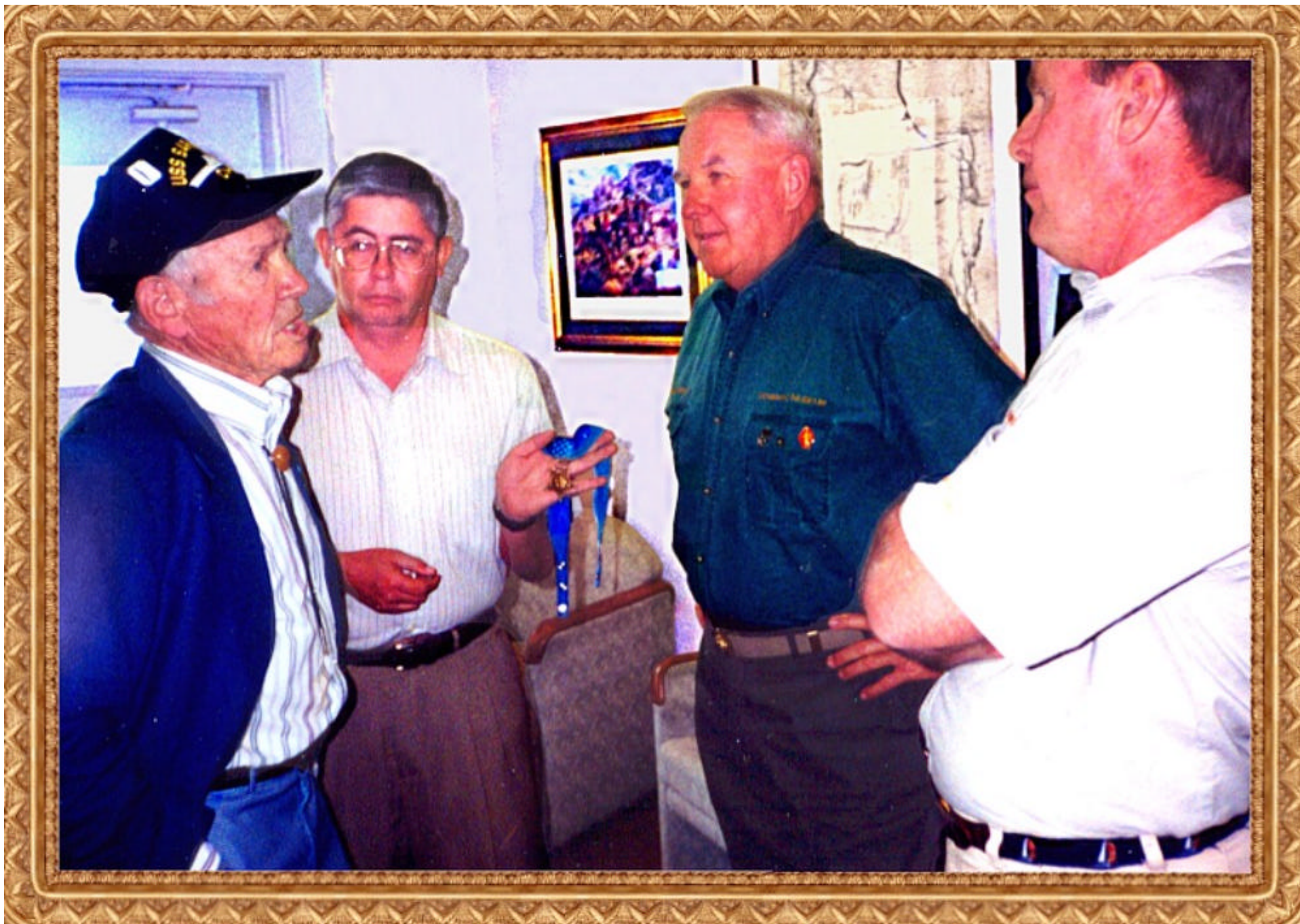
John Finn, the last surviving Pearl Harbor Day Medal of Honor recipient, shares his experiences and his Medal with the staff of the Marine Corps museum at the Marine Corps Recruit Depot in San Diego.