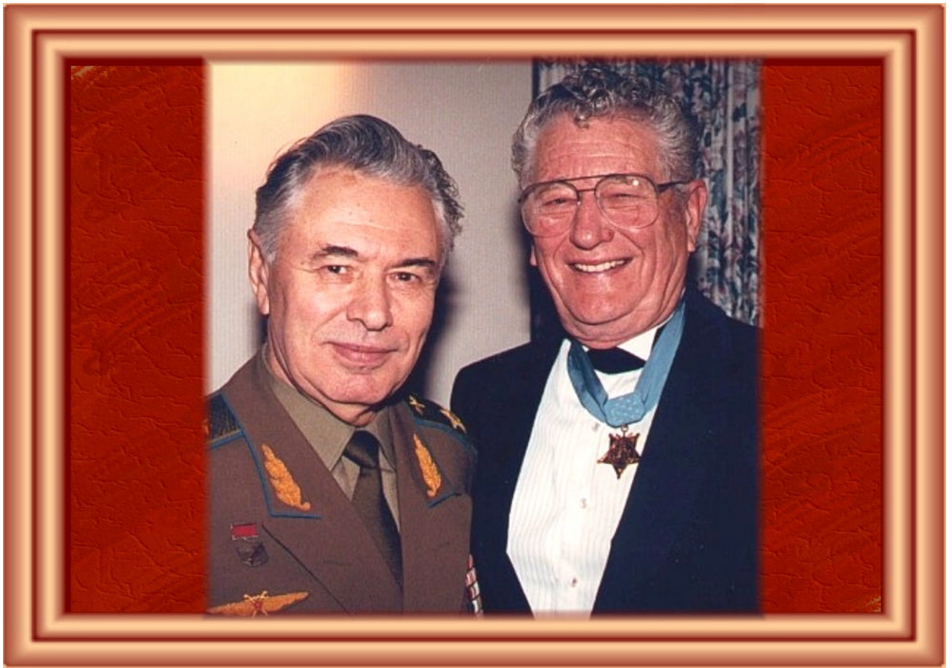
Marine Corps WWII Ace Joe Foss with a Russian soldier who has received his Nation's own version of the Medal of Honor.