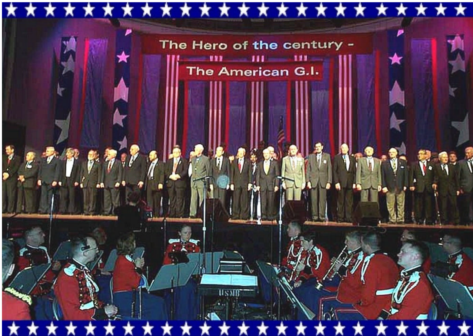
Representing the millions of men and women of the Armed Forces of the United States, nearly 100 Medal of Honor recipients attended an impressive ceremony In our Nation's Capitol to recognize the Hero of the Century, the American G.I.