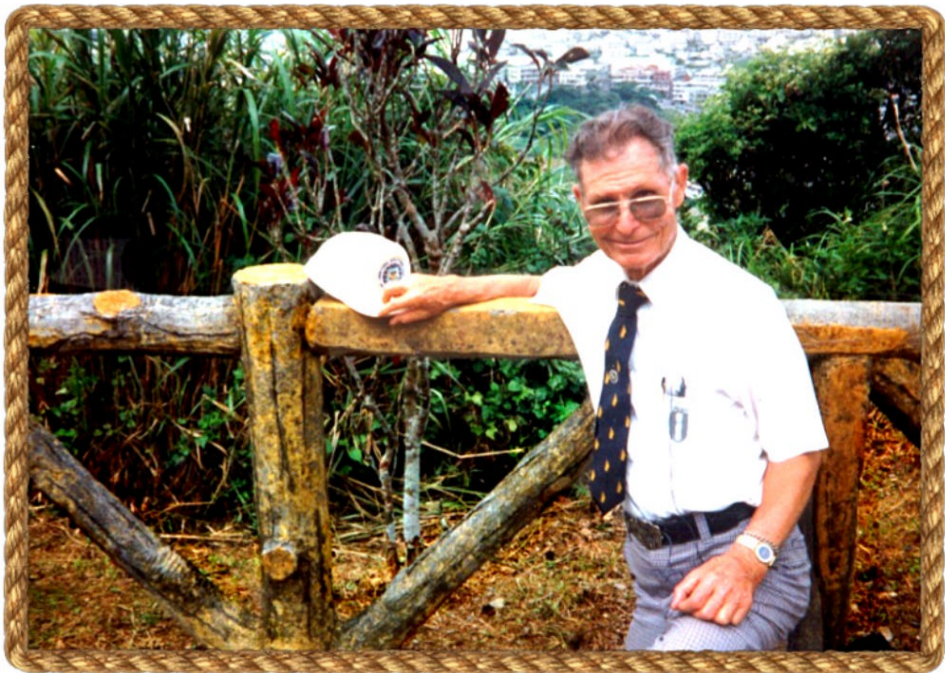
Fifty years after the battle for Okinawa, World War II medic Desmond Doss returns to the spot on the Maeda Escarpment where he rescued more than one hundred wounded soldiers and earned the Medal of Honor.